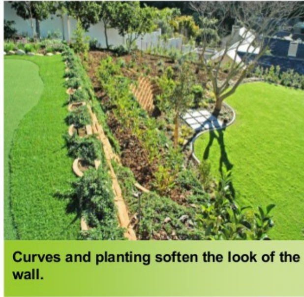
Curves and planting soften the look of the wall.