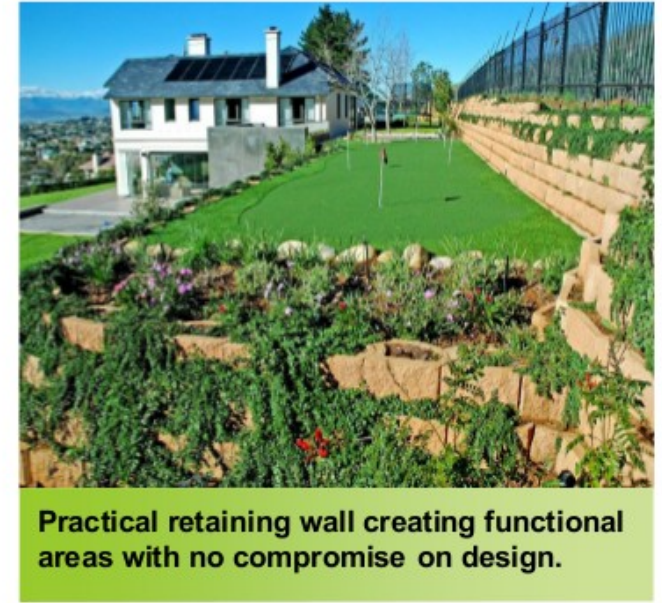
Practical retaining wall creating functional areas with no compromise on design.

Don't let the steep slope in your garden get in the way of your landscaping. TERRAFORCE RETAINING WALLS bring character and function to any landscape. If you are looking to enhance the feel of your garden and create space then a TERRAFORCE RETAINING WALL could be the answer.